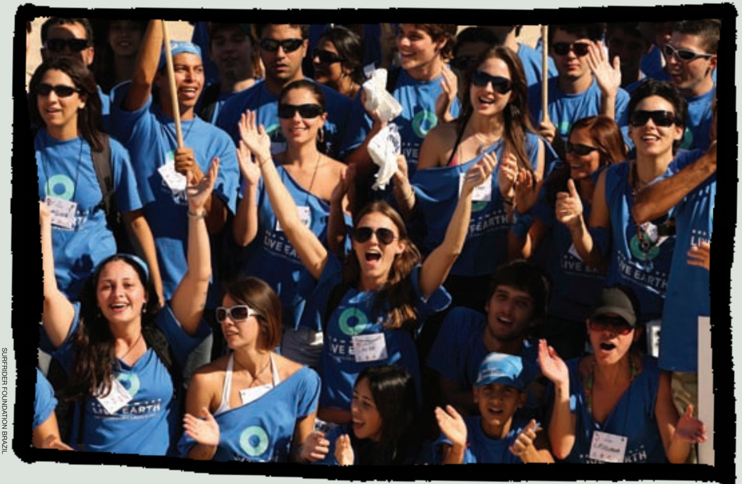
SURFRIDER FOUNDATION BRAZIL

Surfrider Foundation Brazil was approached by Live Earth event organizers, who were concerned about the potential environmental impact of the huge numbers attending the beach concert. Over 350 Surfrider Foundation volunteers were stationed around the venue, educating concertgoers about Surfrider Foundation initiatives and passing out portable cigarette butt ash cans and trash collection bags to the almost 700,000 concertgoers so everyone could participate in making an immediate difference in the coastal environment.